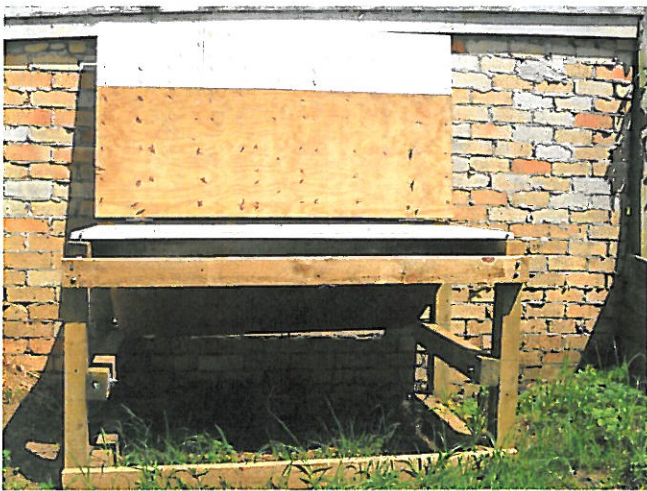
The Worm farm