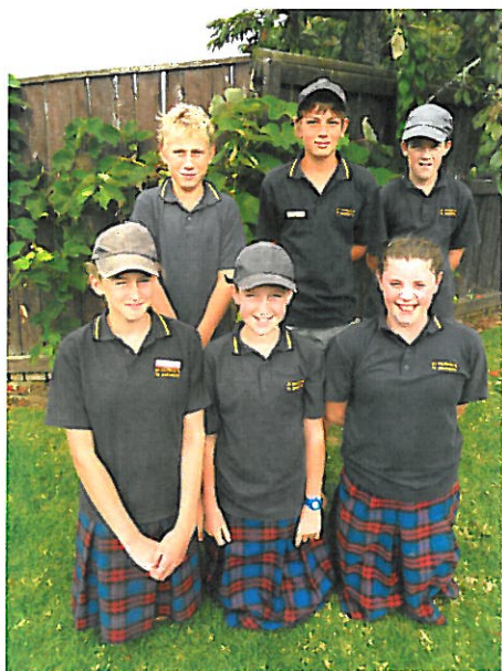
Our WFPS Swimming squad 2011

Now that all of the swimming sports are over a HUGE THANK YOU to those parents who helped us by supporting the events and transporting children – This is very much appreciated!!