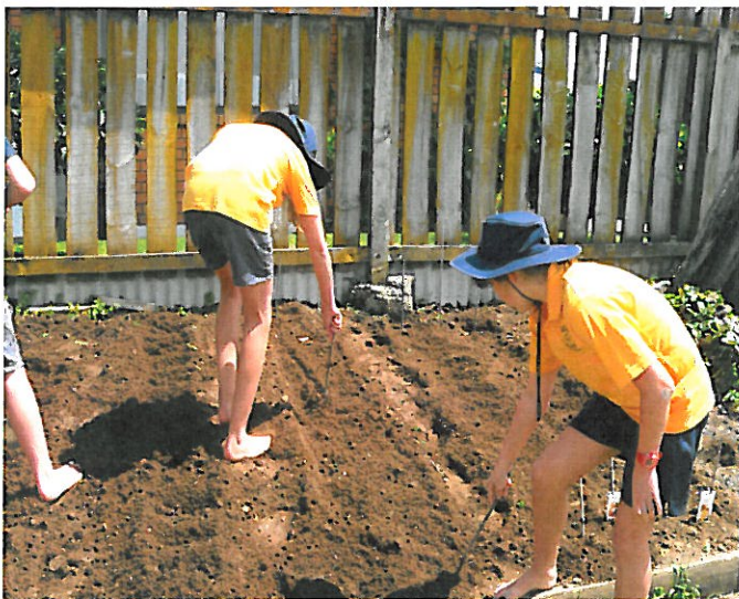
Many hands make light work....