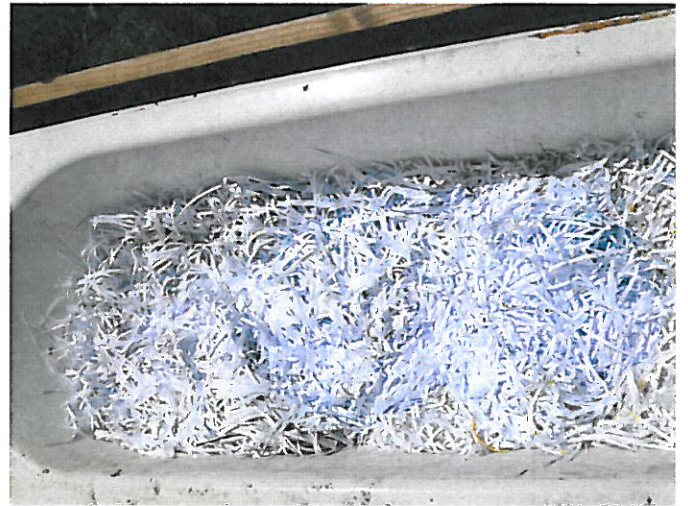
Recycled paper for our worm farm - in an old bath!