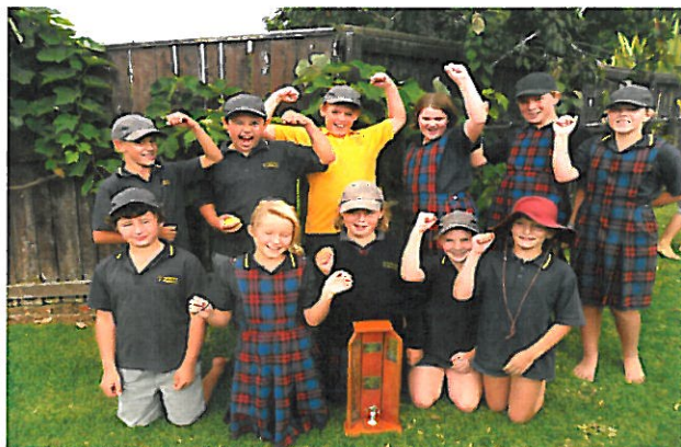
Our Y4-6 Catholic Interschool swimming champions with the trophy – well done!!!