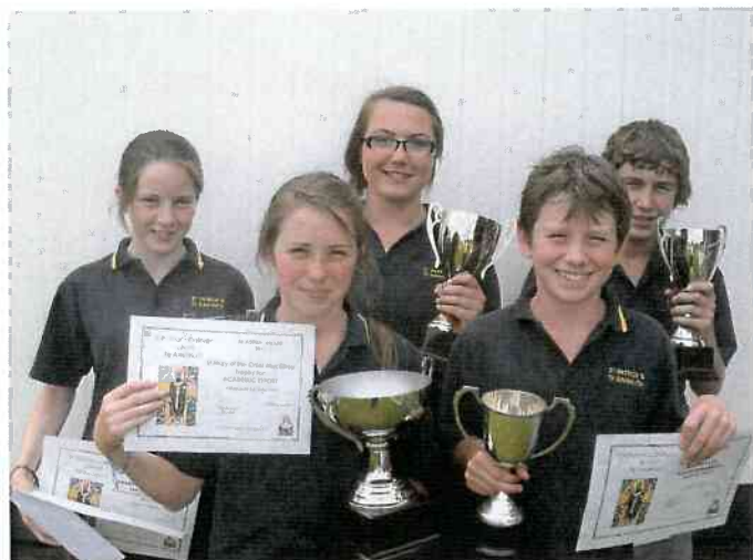
Our 2011 trophy winners Congratulations to you all !!