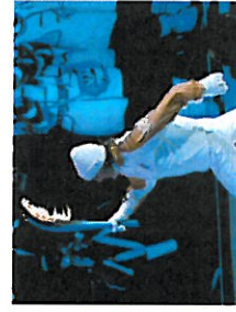
The Olympic Flame

Adapted from Teaching Values , An Olympic Education Toolkit, © 2007, International Olympic Committee, www.olympic.org