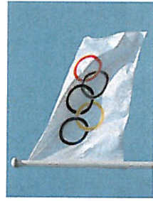
The Olympic Flag