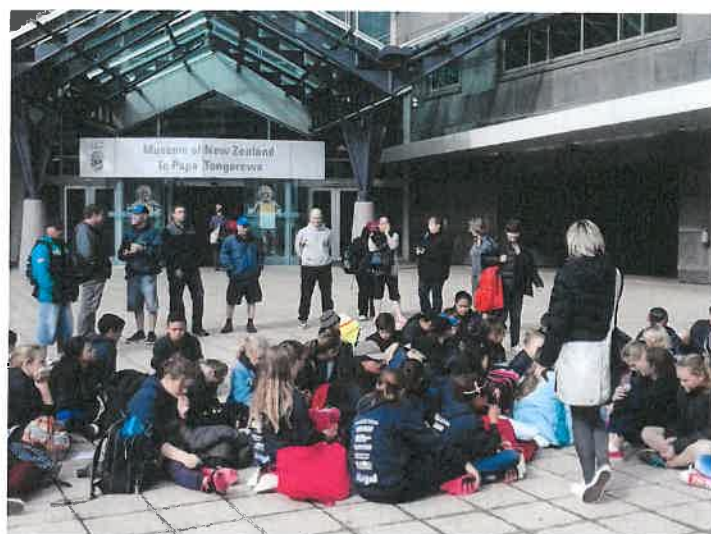
Outside Te Papa