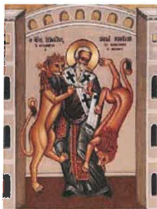
St. Ignatius of Antioch c. 50 - c. 107 Early Church Father Bishop and Martyr Memorial - 17 October