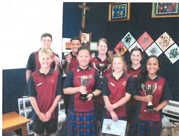
Our 2014 winners