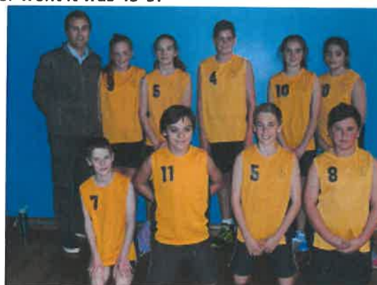
Awesome effort Team!!

On Monday, the 20 th of July, the year 7&8 basketball team was in the finals playing for 3 rd & 4 th place. We played against TAI Pussy Cats and we won!!!! As the final buzzer went it was 49-9.