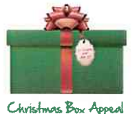
Christmas Box Appeal

School Supplies: pens, pencils and sharpeners, crayons, markers, notebooks, paper, solar calculators, colouring and picture books, etc.