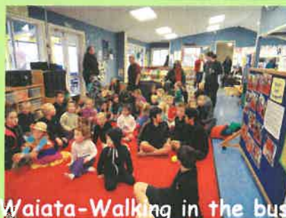
Waiata-Walking in the bush

Hākari celebrations for Matariki with Rewi Street Kindergarten and Room 8 St Patrick's Catholic School