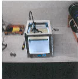
Our IT group visited an IT Lab at Waikato University last Friday...Looking at a 3D printer!