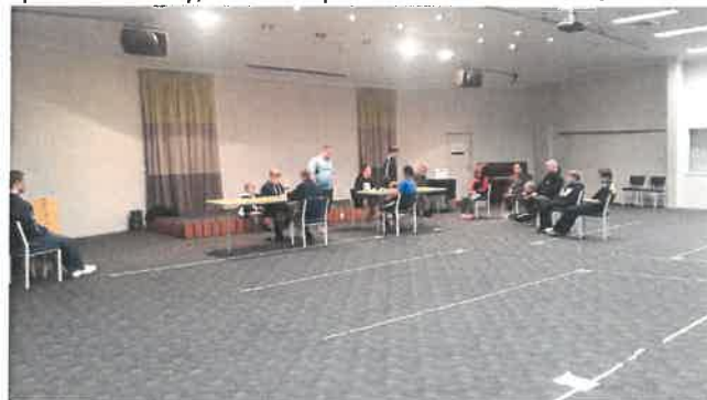
Our students at Chess.

Our students are doing really well with groups in the semi-finals for: Soccer, Wall ball, Pentaque, Croquet, Girls Hockey, Netball, and Girls & Boys Volleyball. So of the 14 semi-final sports on today, we are represented in 8 of them!