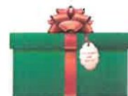
Christmas Box Appeal

in this Newsletter giving ideas of what gifts to provide. As always, we thank you for your generosity!