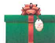
Christmas Box Appeal

Time to fill the shoeboxes again! Each year all classes are asked to fill up shoeboxes with small gifts suitable for boys and girls. The boxes are sent to children in the Pacific Islands. We have until tomorrow. Please see the insert in this Newsletter giving ideas of what gifts to provide. As always, we thank you for your generosity!